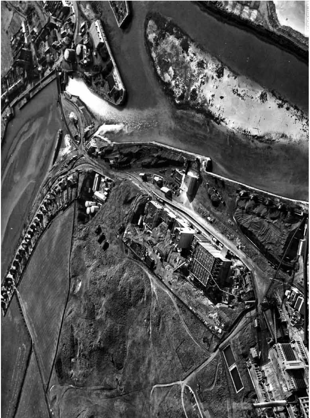
1950 aerial view of North Quay, Hayle. The Bromine Works can be clearly seen with the compact Sulphuric Acid Plant in the NW corner of the site next to the old Pentowan Calciner chimney. The Sulphur Store is on the Quay adjacent to the old Lime Kiln)