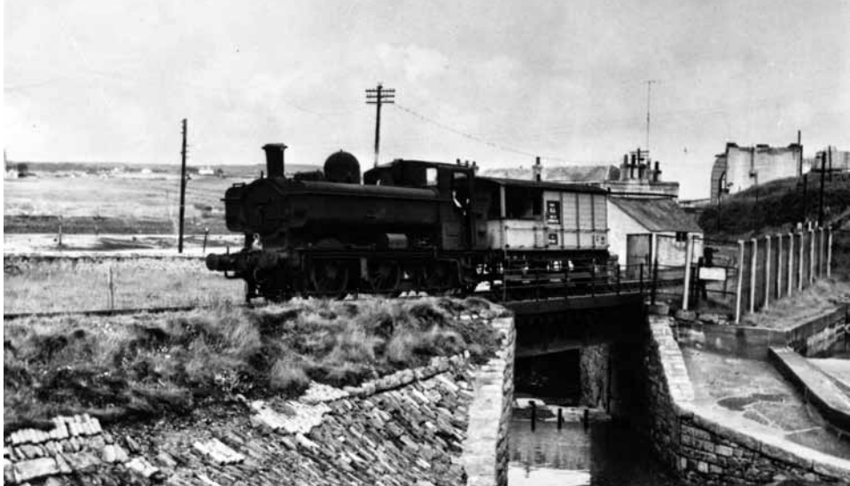
0-6-0 pannier tank and brake van crossing the sluice way at the edge of Copperhouse Pool.

Association, an organisation established in 1919 to operate a sulphur pool on behalf of its members. Purchases and shipments of sulphur were arranged by the Association directly with the harbour authority, in this case, with Harvey & Co.