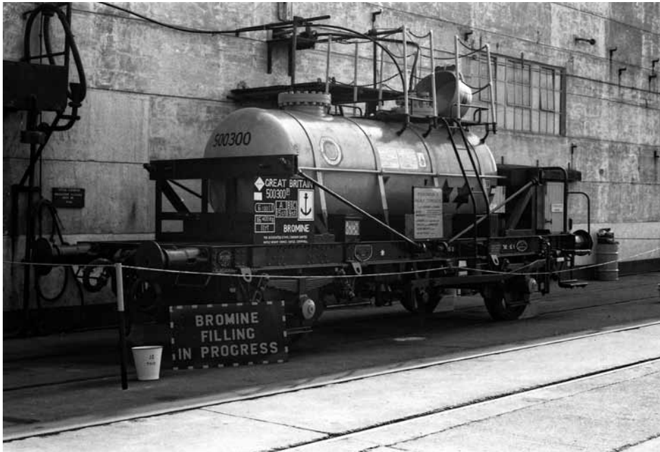
International, ferry registered, bromine tanker berthed ready for filling on Works yard.

A more significant change to traffic patterns occurred when Chlorine Works at Ellesmere Port was commissioned in 1958. ICI had given notice of its intention to cease supplying the Company’s heavy chlorine requirements in 1955 so in-house facilities had to be built. An additional fleet of 35 14ton payload tankers were built by Hurst Nelson between July 1957 and Feb 1958. This was the last order for tankers built to the standard Railway Clearing house design. From early 1958 Hayle and its sister bromine plant in Anglesey were supplied from Ellesmere Port