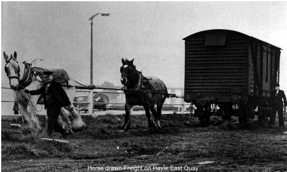
Horse drawn Freight on Hayle East Quay

A branch line from Hayle Wharves to the Sandhills some 25 chains in length was part of the original Hayle Railway. After the arrival of the West Cornwall Railway a new connection to the wharves was made from Hayle Station, opening in 1852. This branch was 55 chains long, had a gradient of 1 in 30 and one of the very first sand drags provided on any UK railway. From 1877 to 1892 broad gauge trains could access the branch, while shunting on the quays by railway horse and chain took place until April 1961. A branch from the line of the former Hayle Railway served the National Explosive Works during the First World War. The Wharves branch closed in July 1982, when Hayle signal box was decommissioned.